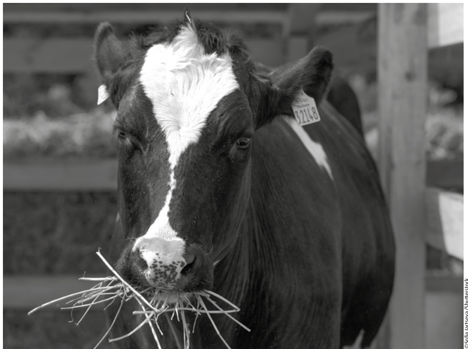
Asking your customers to 'chew their cud' twice drives future disloyalty

who takes the call deals with the call, if not ensure they pass on all the information to the next person.